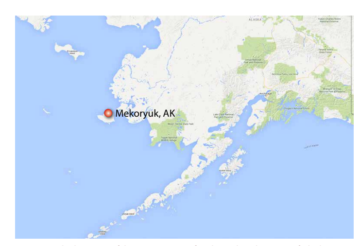
FIGURE\ 2. The\ location\ of\ the\ community\ of\ Mekoryuk\ in\ the\ State\ of\ Alaska, USA.

The 2010 US Census indicated that the community had 191 members, 70 households, and 40 families. There were 86 housing units, 11 of which were vacant on a seasonal basis. The people in Mekoryuk are predominantly indigenous; 97% are Alaska Native and/or of American Indian heritage. The median household income is $26,250, while the median family income is $58,750. The per capita income is $22,233, and about 28% of the population is below the poverty line.