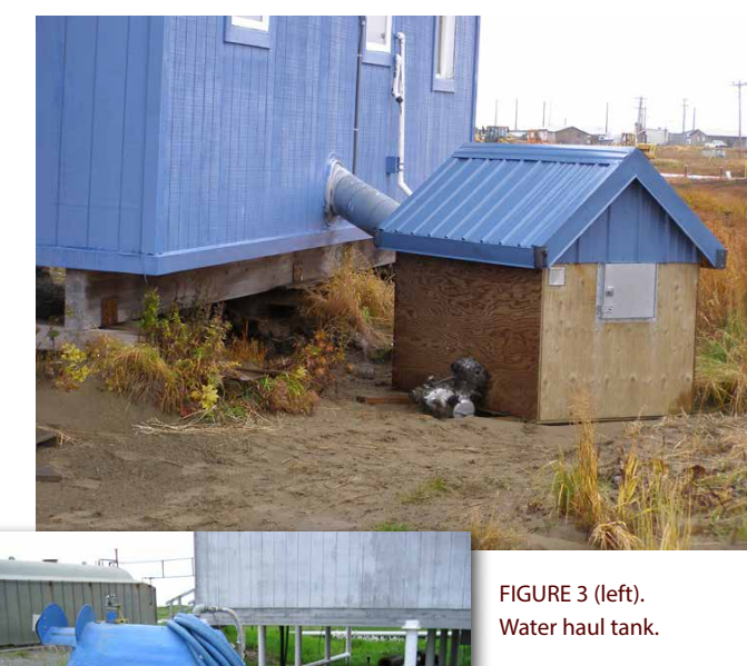
FIGURE 4 (above). Flush tank and haul sewage tank, commonly known as "a dog house."

Mekoryuk currently has a 4.3-acre wastewater lagoon located several miles from town and a lined water reservoir (Figure 5) near