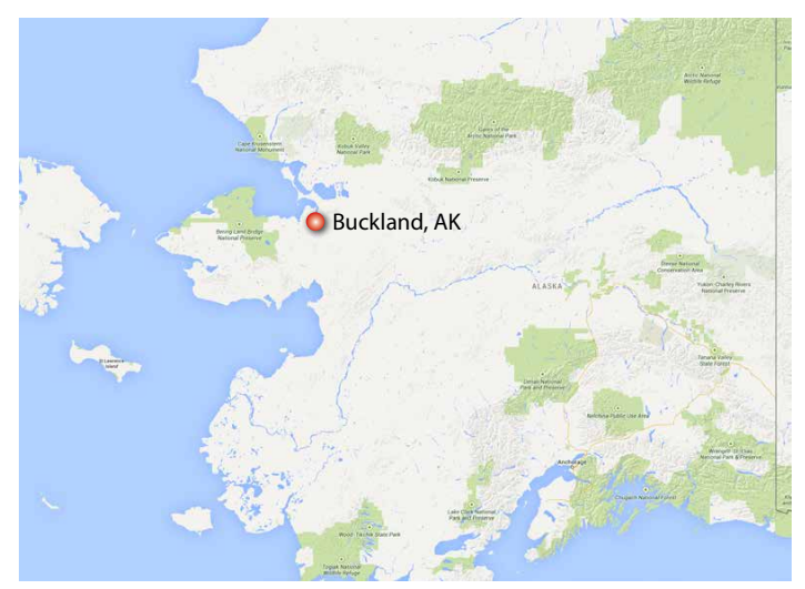
FIGURE 1. Buckland in relationship with the State of Alaska, USA.

The community's water source is surface water from the Buckland River. Until the 1980s, Buckland was primarily a "honeybucket community," with infrastructure that consisted of a central watering point connected to the local water treatment plant where residents could do laundry, use toilets, take showers, and transport treated water to their homes. This central watering