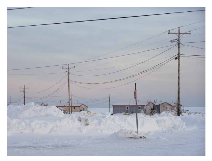
FIGURE 7. A road, cleared of snow, between town and the airport.

challenge for the haul operator<sup>30</sup> to maneuver through the limited space adjacent to the tanks and the typically small homes.