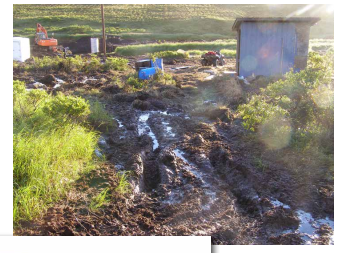
FIGURE 8 (above). Conditions of a trail leading to water source, Mekoryuk, Alaska.

Although appreciative of having access to a water and sanitation system, users are not fully satisfied with the performance of flush tank and haul systems. They desire a piped system. Their frustration is evident in statements such as, "We are no different than other human beings, we pay taxes like any other citizen, so we want a piped system to continue improving our community; our younger generations are living in the electronic age, we cannot stay in the dinosaur age with these systems; we need to follow up on health improvements."